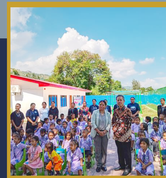
STORY TELLING PROGRAM FROM PUSAT BUDAYA INDONESIA (PBI) DILI, 03-27-2024.

This is the first PBI program at IQRS. Indubitably, will continue in the future with various existing programs.